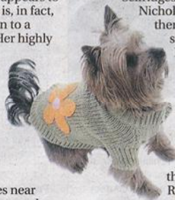
JUMP TO IT: Doggie jumper, £23.50, from Puchi petwear.